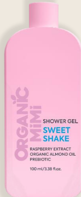
SHOWER GEL SWEET SHAKE, 100 ml