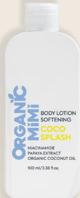
BODY LOTION SOFTENING COCO SPLASH, 100 ml