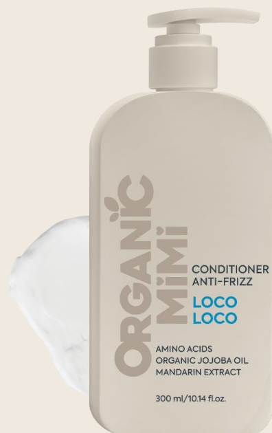
CONDITIONER ANTI-FRIZZ LOCO-LOCO, 300 ml