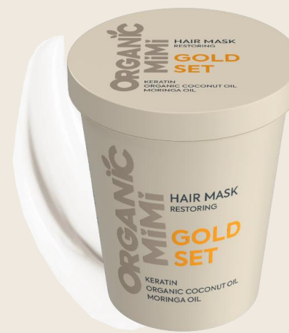
MASK RESTORING GOLD SET, 200 ml