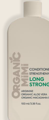
CONDITIONER STRENGTHENING LONG STRONG, 100 ml