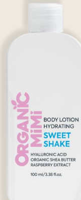
BODY LOTION HYDRATING SWEET SHAKE, 100 ml