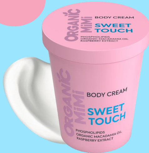
BODY CREAM SWEET TOUCH, 200 ml