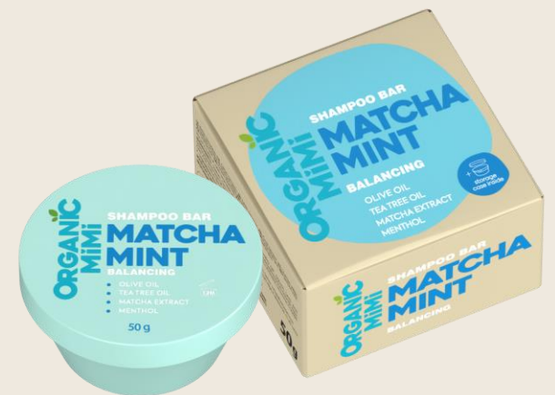
MATCHA MINT BALANCING SHAMPOO BAR, 50 g