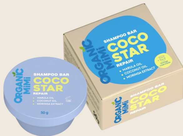
COCO STAR REPAIR SHAMPOO BAR, 50 g