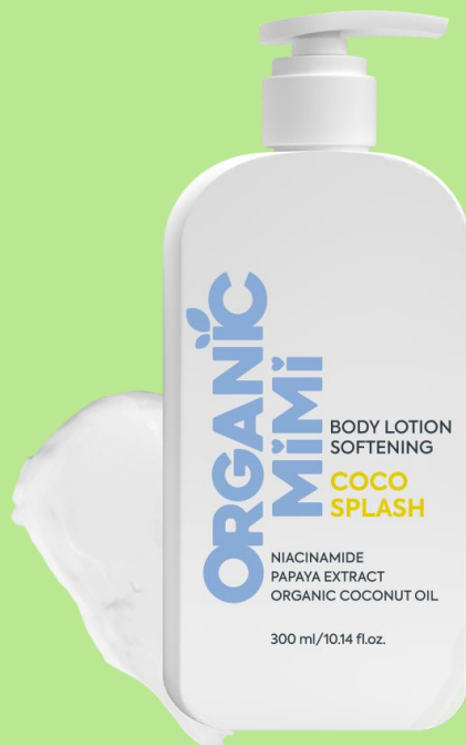
BODY LOTION SOFTENING COCO SPLASH, 300 ml