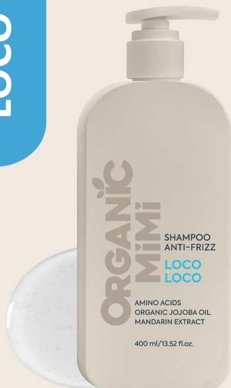
SHAMPOO ANTI-FRIZZ LOCO-LOCO, 400 ml