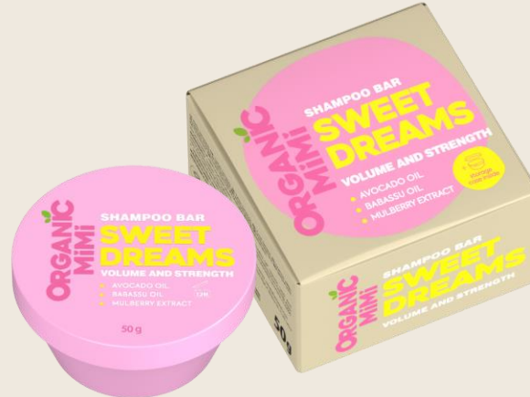
SWEET DREAMS VOLUME AND STRENGTH SHAMPOO BAR, 50 g