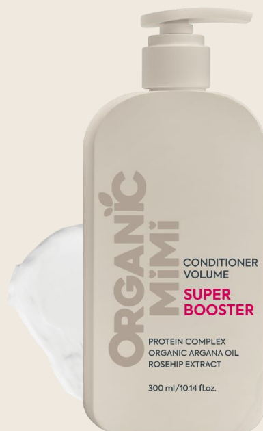
VOLUME CONDITIONER SUPER BOOSTER, 300 ml