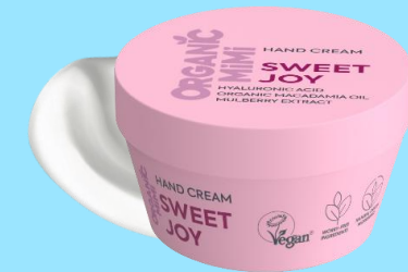
HAND CREAM SWEET JOY, 50 ml