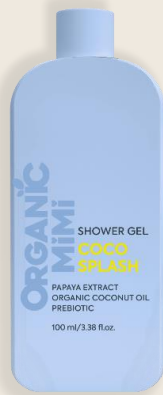
SHOWER GEL COCO SPLASH, 100 ml