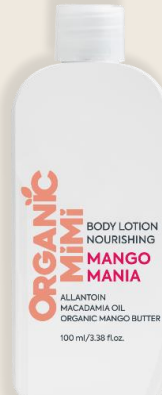
BODY LOTION NOURISHING MANGO MANIA, 100 ml