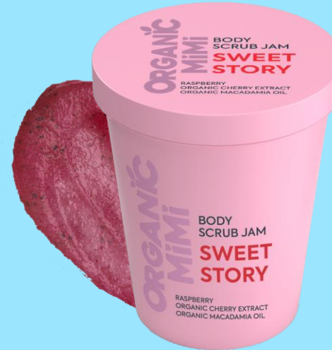
BODY SCRUB JAM SWEET TOUCH, 250 g