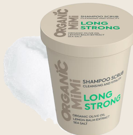
SHAMPOO SCRUB CLEANSING AND VITALITY LONG STRONG, 310 g