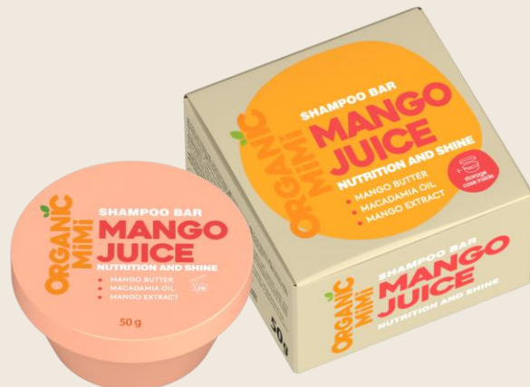
MANGO JUICE NUTRITION AND SHINE SHAMPOO BAR, 50 g