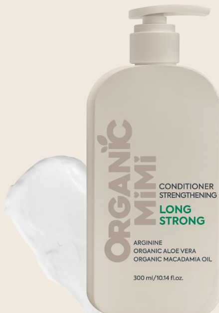
STRENGTHENING CONDITIONER LONG STRONG, 300 ml