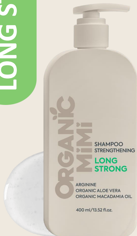
STRENGTHENING SHAMPOO LONG STRONG, 400 ml