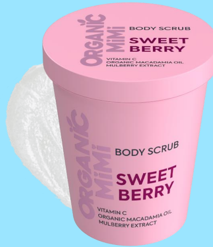
BODY SCRUB SWEET BERRY, 250 g