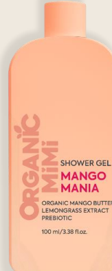
SHOWER GEL MANGO MANIA, 100 ml