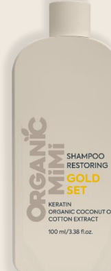
SHAMPOO RESTORING GOLD SET, 100 ml