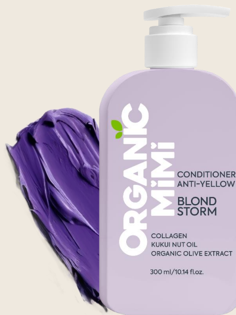
CONDITIONER ANTI-YELLOW BLOND STORM, 300 ml