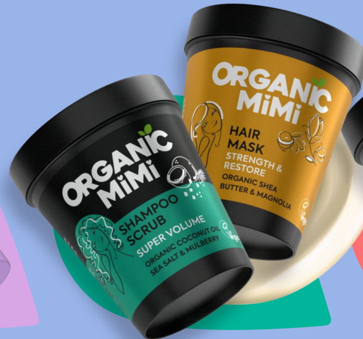
HAIR CARE 7 SKU