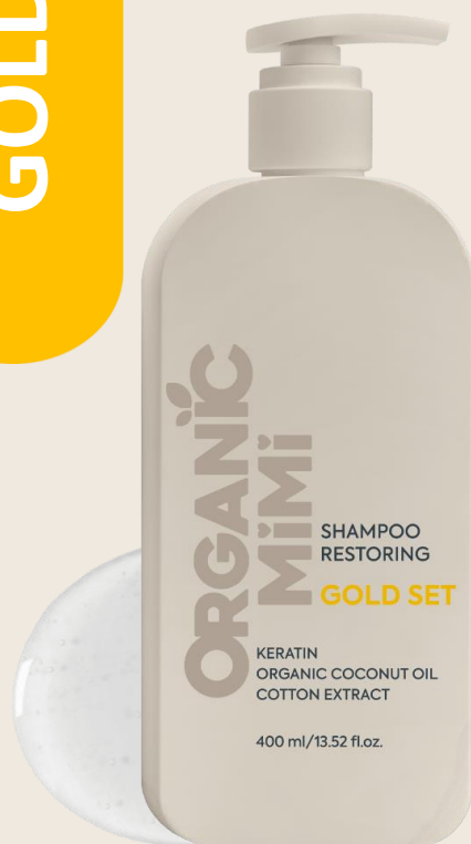
RESTORING SHAMPOO GOLD SET, 400 ml