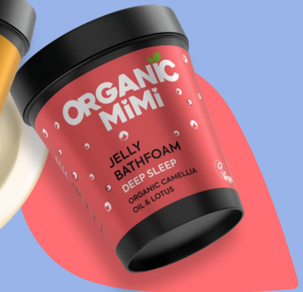
BATH FUN 3 SKU