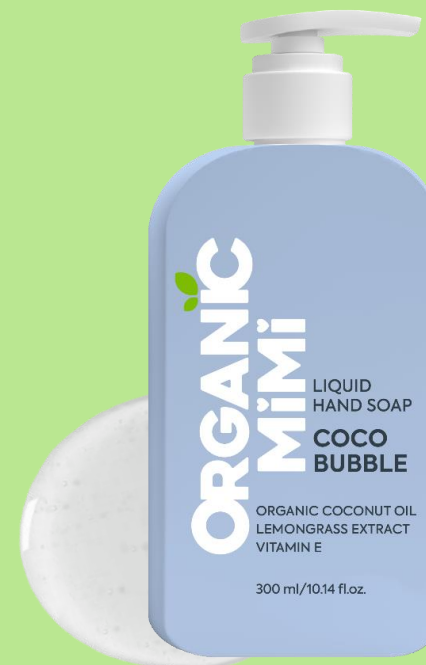
LIQUID HAND SOAP COCO BUBBLE, 300 ml