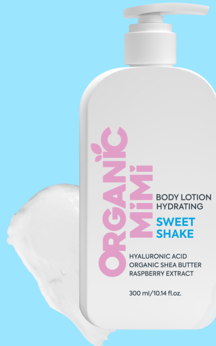
BODY LOTION HYDRATING SWEET SHAKE, 300 ml