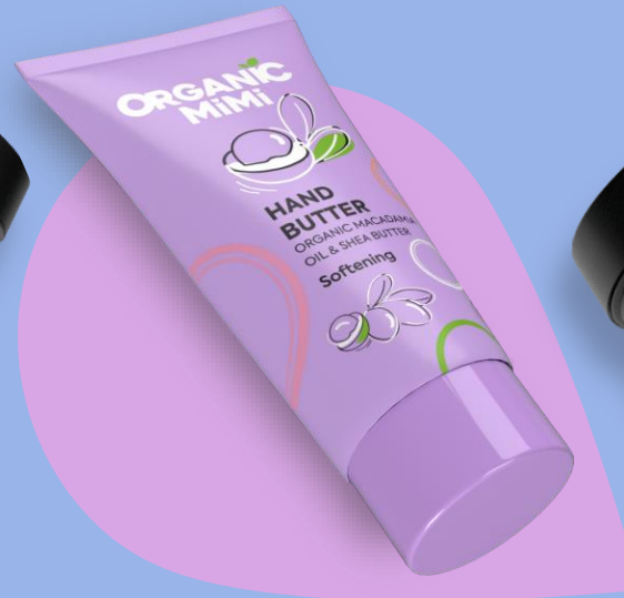
HAND & FOOT CARE 10 SKU