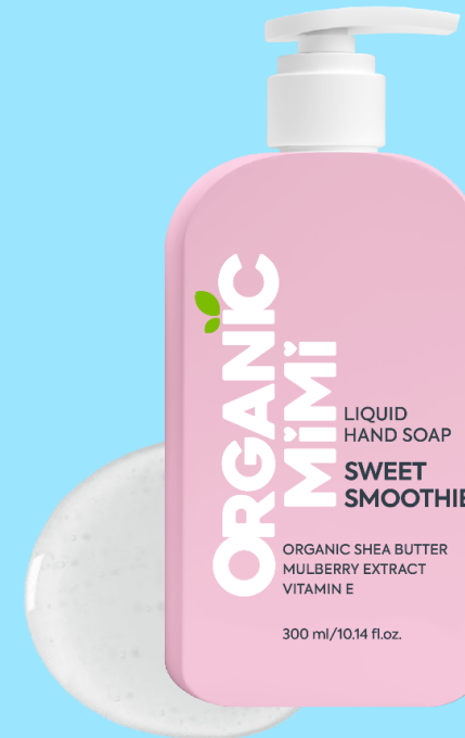
LIQUID HAND SOAP SWEET SMOOTHIE, 300 ml