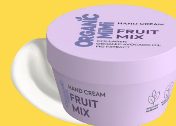
HAND CREAM FRUIT MIX, 50 ml