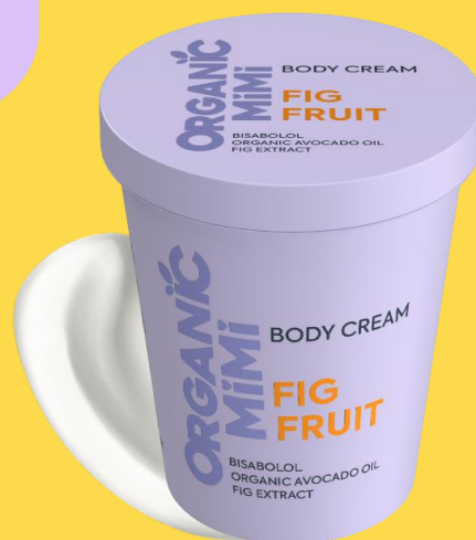
BODY CREAM FIG FRUIT, 200 ml