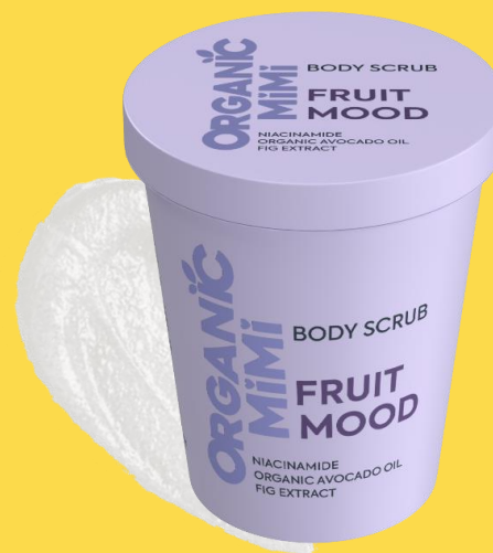
BODY SCRUB FRUIT MOOD, 250 g