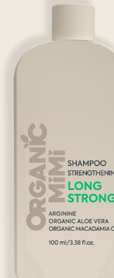
SHAMPOO STRENGTHENING LONG STRONG, 100 ml