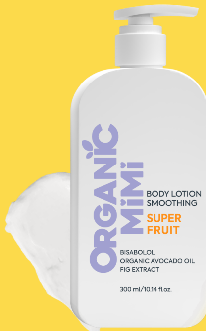
BODY LOTION SMOOTHING SUPER FRUIT, 300 ml