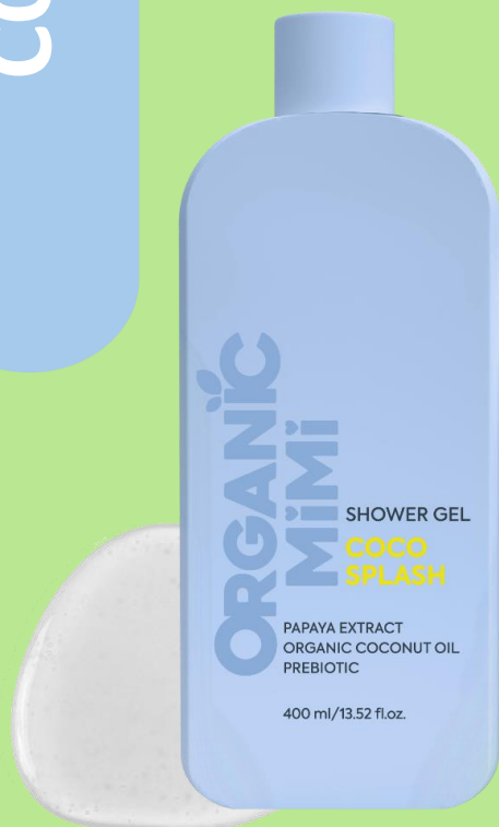
SHOWER GEL COCO SPLASH, 400 ml