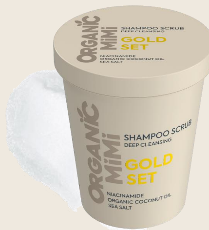
SHAMPOO SCRUB DEEP CLEANSING GOLD SET, 310 g