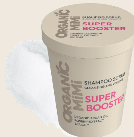
SHAMPOO SCRUB CLEANSING AND VOLUME SUPER BOOSTER, 310 g