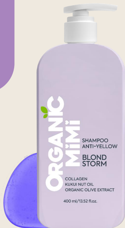
SHAMPOO ANTI-YELLOW BLOND STORM, 400 ml