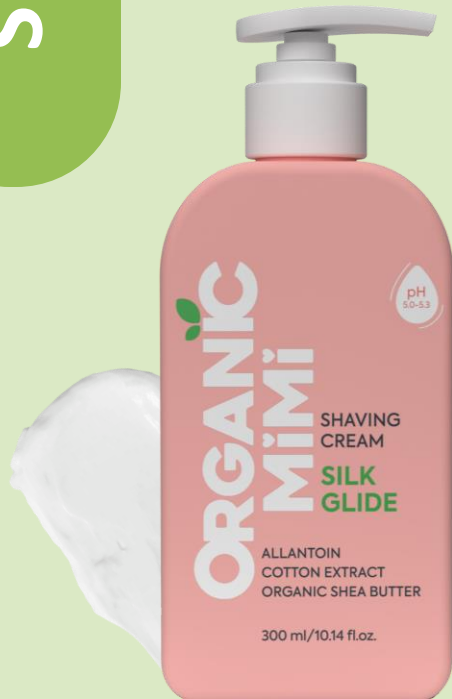
SHAVING CREAM SILK GLIDE, 300 ml