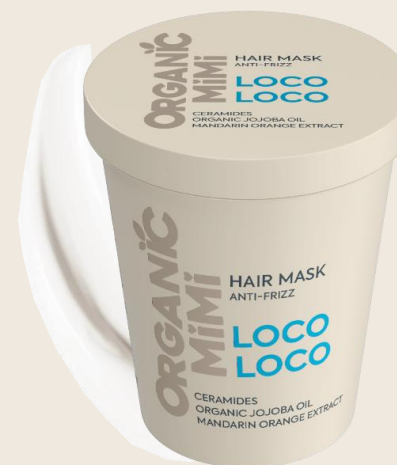
HAIR MASK ANTI-FRIZZ LOCO- LOCO, 200 ml