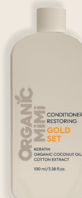
CONDITIONER RESTORING GOLD SET, 100 ml