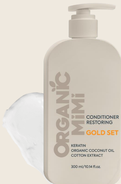
RESTORING CONDITIONER GOLD SET, 300 ml