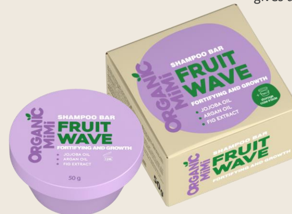
FRUIT WAVE FORTIFYING AND GROWTH SHAMPOO BAR, 50 g