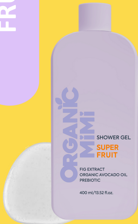
SHOWER GEL SUPER FRUIT, 400 ml