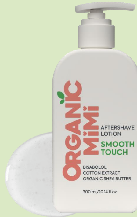
AFTERSHAVE LOTION SMOOTH TOUCH, 300 ml