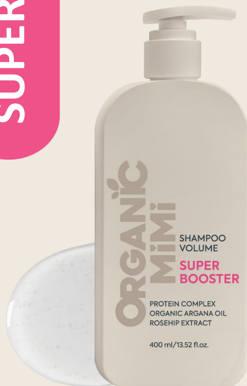
VOLUME SHAMPOO SUPER BOOSTER, 400 ml