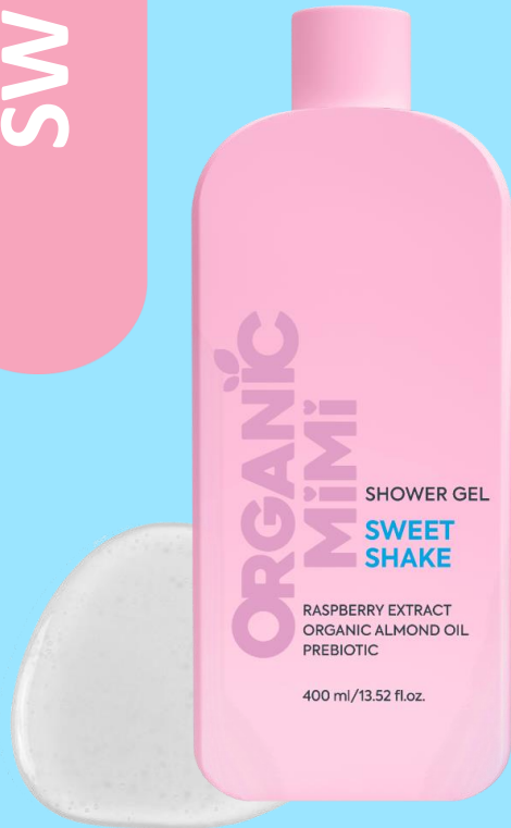
SHOWER GEL SWEET SHAKE, 400 ml