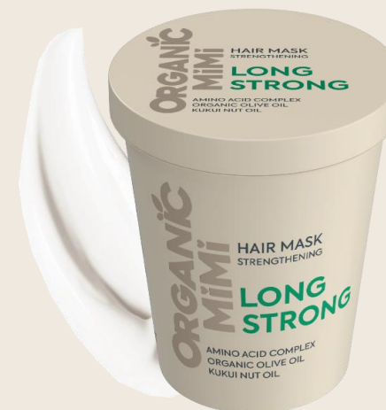
MASK STRENGTHENING LONG STRONG, 200 ml