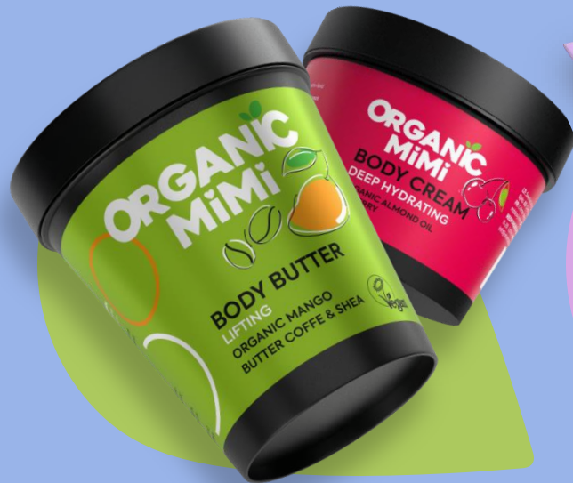
BODY CARE 46 SKU